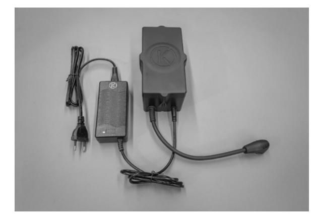
Charger connected to the mains power supply