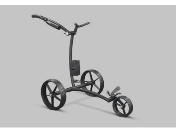
All trolley components