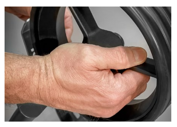
When you release the button, the lock grips the axle.