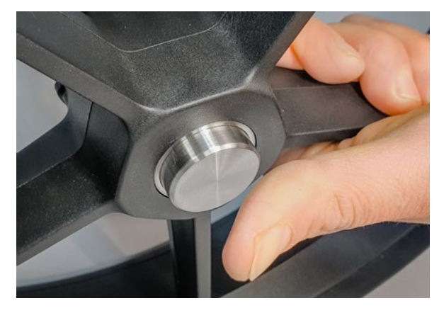
When you release the button, the lock grips the axle. The front groove on the axle is used as a locking mechanism for freewheeling without using the motor.