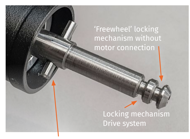
Drive pin: The engine meshes with the wheel's adapter plate.