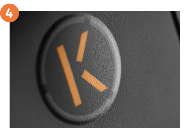
The trolley has a speed memory feature, which saves the last speed of travel (when you press the Start/Stop button). To travel at the preset speed, all you have to do is press the Start/Stop button.

Turn counter-clockwise to slow down the trolley.