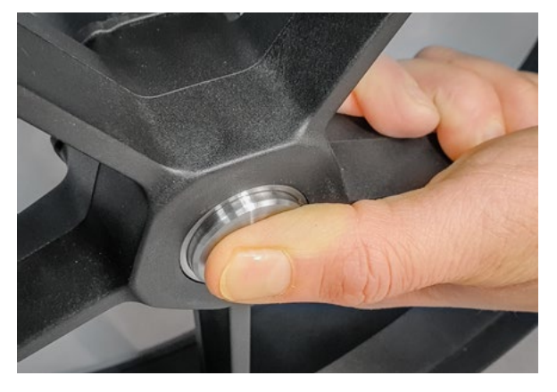
Attach the wheels. Press and hold the metal buttonwhen attaching the wheel. Slide in to the stop (rear axle groove).