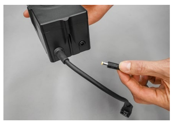
Connecting the charger to the battery