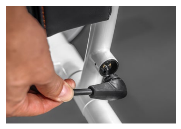
Connect the battery using the magnetic connector. The connector faces forwards horizontally. The flashing signal on the upper control unit indicates that the battery has been connected properly.