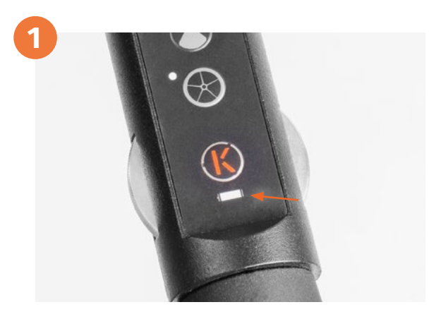
The trolley is ready to start when the LEDs under the 'K' are illuminated continuously. The battery charge status indicator has 3 LEDs.