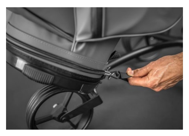
Secure the bag to the lower bag holder by attaching the rubber cords to the mounting point.

The bag rest is fixed, i.e. it cannot be adapted to fit various bag sizes.