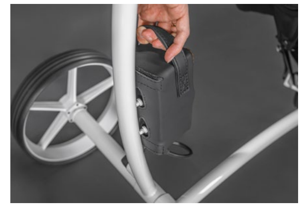
Do not let the plug touch the ground to avoid soiling.

Attach the battery to the two pins on the handlebar with the cable facing downwards