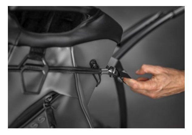
Secure the bag to the upper bag holder by attaching the rubber cords to the mounting point.