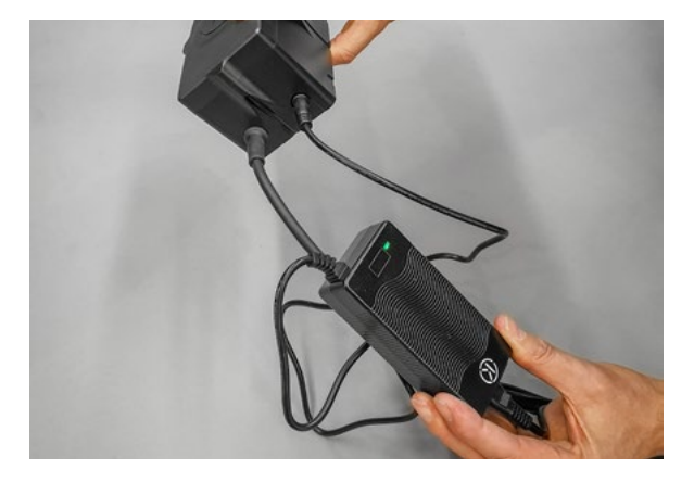
The battery and charger are not connected properly until a noticeable resistance at the battery connection has been overcome. Charging can start.