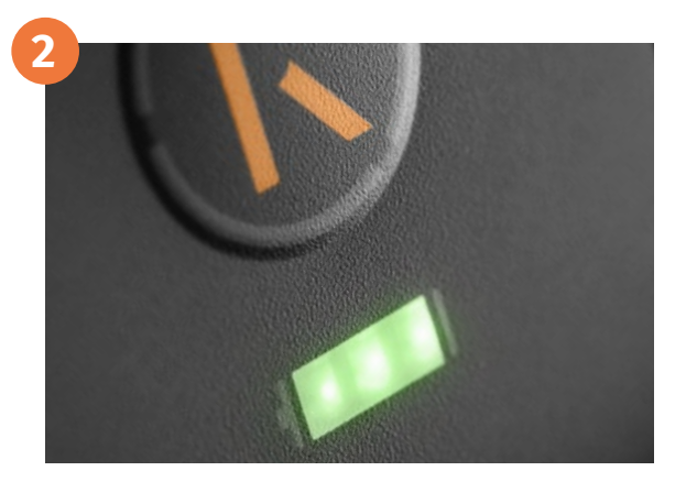
Switch on the trolley by pressing the Start/ Stop button 'K' briefly. The battery charge status indicator lights up. 3 x green = full charge. As the trolley is used, this reduces to 2 x green, 1 x green, orange, red = almost empty.