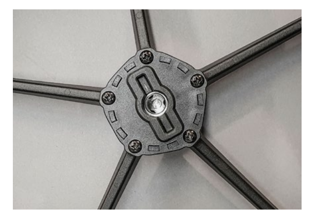
Rear of drive wheel