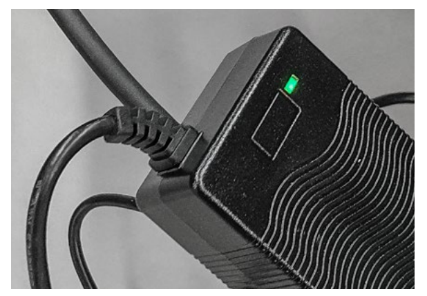
Charge the battery for 24 hours non-stop before using the trolley for the first time.